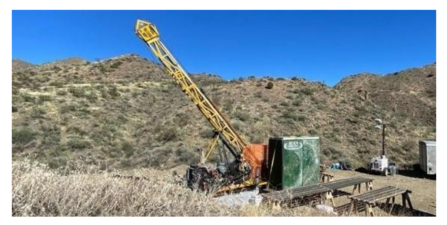
Figure 1: Diamond drilling in Hole #3